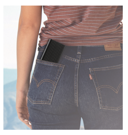
Pocket Size and Easy to Carry