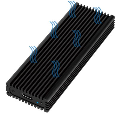
Heat Dissipation Design