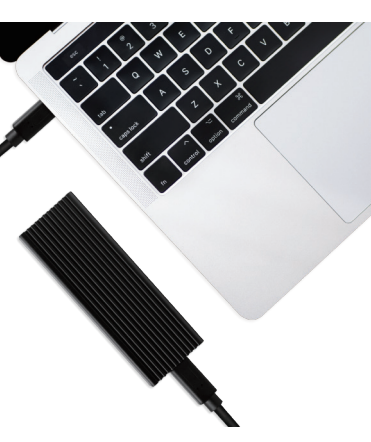
Plug and Play